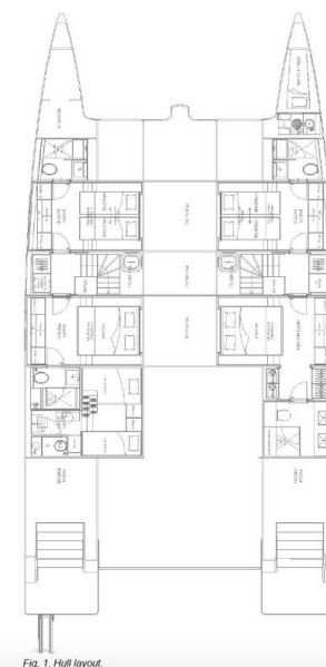
Fig. 1. Hull layout.